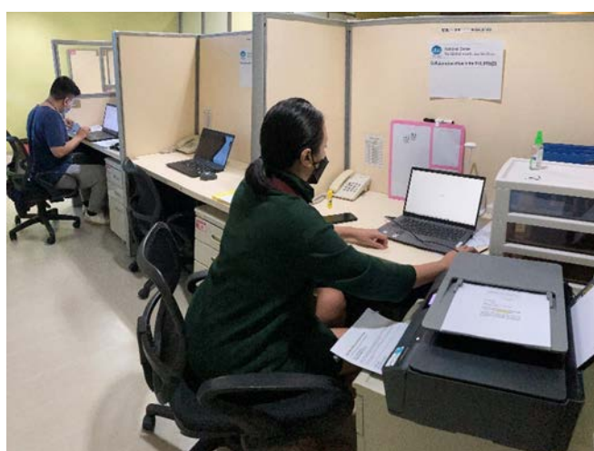
Collaborative office at University of Philippines Manila