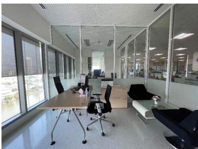
Collaborative office at Faculty of Medicine of Siriraj Hospital