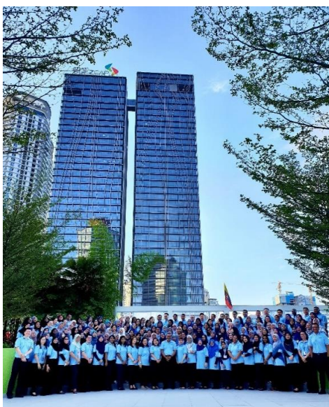
Clinical Research Malaysia

UMMC is the leading Academic Research Organization (ARO) for clinical research in Malaysia and has been involved in clinical research over 20 years. It operates under the Ministry of Higher Education of Malaysia and has an advanced clinical research unit. It is also working closely with CRM. Like CRM, UMMC has been involved in nearly 300 clinical trials last year. UMMC is interested in joining ARISE, the NCGM-led ARO network for clinical research in Asia. Collaborations with CRM and UMMC Malaysia will surely strengthen the clinical trials network among ASEAN and East Asia countries.